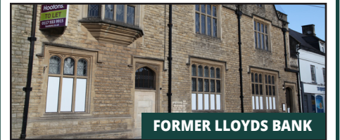
FORMER LLOYDS BANK

The Neighbourhood Plan will list heritage assets that don't have Listed status but still have an important historical value to the local community.